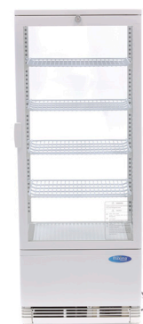
White display fridge with lock in door