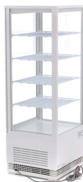
Double glazing on 4 sides